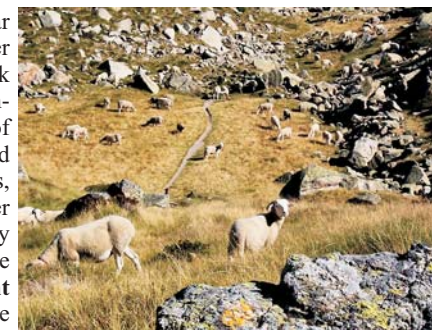
The descent into France

Descending into France on a clear path, we pass a small dry-stone shelter built into a slab of overhanging rock (Wp.8 65M). We then follow a cairn-marked route snaking through a sea of debris, the stone so heavily burnished by generations of hooves and boots, the cairns are largely superfluous, after which we descend to the grassy 'beach' on the southern side of the larger of the Estanys de Fontargent (Wp.9 75M). We return by the same route.