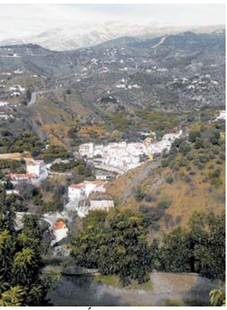
Árchez & La Maroma

Heading downstream (SE), we ford the river four times before passing the picturesque Molino Winkler (AKA Molino Dña Fidela ) and crossing a footbridge to reach the riverside promenade in Árchez (Wp.1378M).